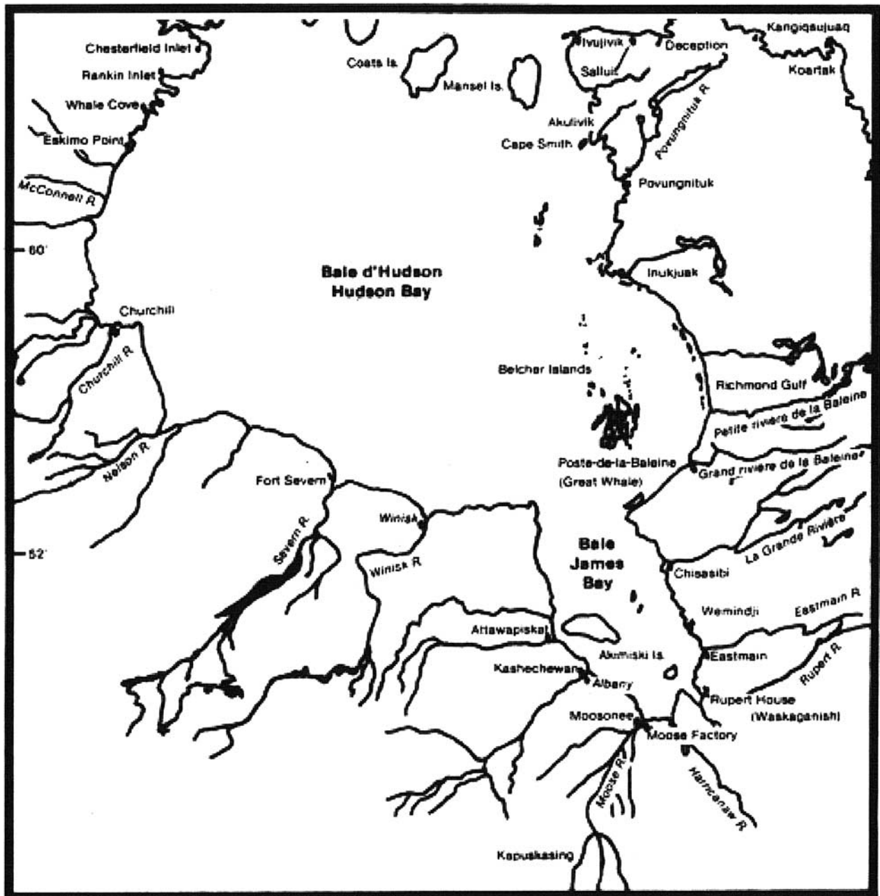
Figure 2. The James Bay as a part of the Hudson Bay catchment.

tence harvest of these two species in some years exceeded the entire Quebec commercial catch and outperformed other major Canadian subarctic fisheries on a catch per unit effort basis (Berkes 1979) (Figure 2).